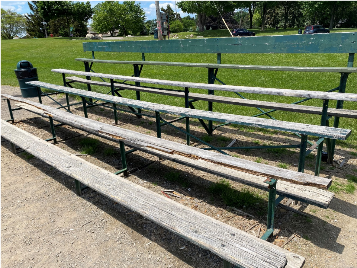
New Bleacher Example